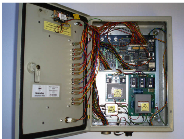
Figure 1: Wall mounted monitoring unit - inside view

During the operating cycle of each machine, the system was required to continuously sample pressure readings and then apply specially developed algorithms in order to detect and report various types of failure which would affect the quality of the product if undetected.