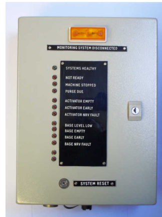
Figure 2: Wall mounted monitoring unit - front view

A custom-designed microcontroller-based unit, utilising an 80C251, in a self-contained wall-mounted enclosure, was designed, one such for connection to each machine. These units incorporated audible and visual fault warning devices, as well as having the capability of halting the machine when a programmable level of faults was detected.