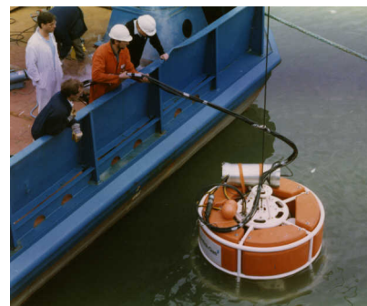
Figure 3: Survey in progress

The system was not only applied internally by British Gas but it also achieved commercial success for the company as a result of a worldwide licensing agreement with a leading multinational subsea surveying organisation.